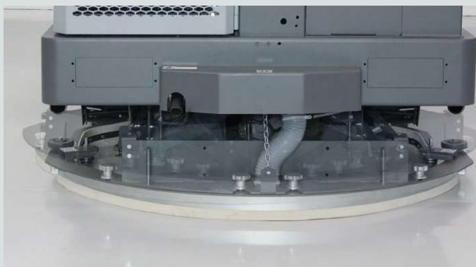
Patented Accu-Track™ squeegee provides superior water pick-up even during the tightest turns.