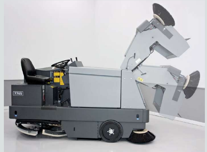
All-steel, 16 cubic foot debris hopper has a variable 60 inch dump system.