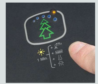
EcoFlex™ System Burst of Power button easily increases cleaning performance.