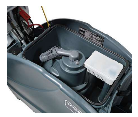
Flip-up lid and tilt-back tank provides easy access to the recovery tank, debris catch cage, batteries and EcoFlex^{TM} cartridge.