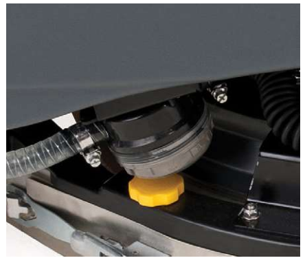
Externally mounted solution filter allows operators to easily clean the filter and manage the solution level.