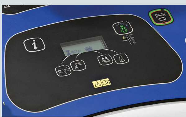
Simple, intuitive controls minimize operator training.