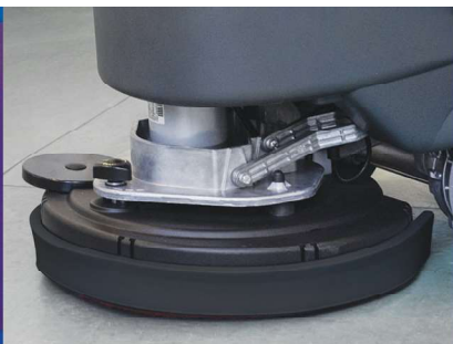
Optional splash guard keeps water in the path of the squeegee even at the fastest operation speeds.