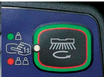
Raise, lower or even double the brush pressure right from the dashboard for even more cleaning power.