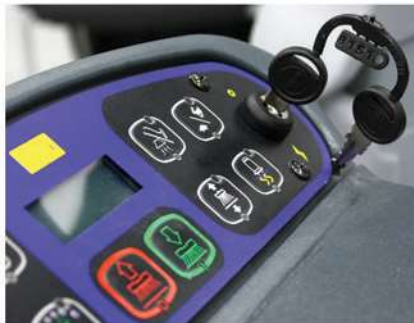
Large One-Touch™ controls make operation easy and accessible.