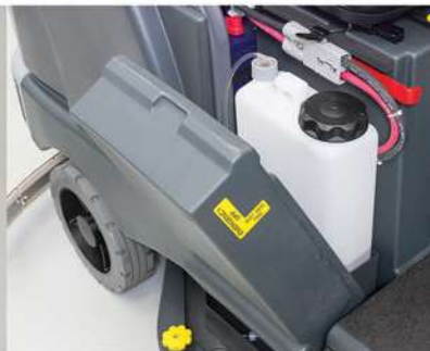
Removable, high capacity detergent cartridge for sustained flexible cleaning is available with optional EcoFlex™ System.