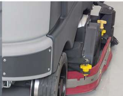
Powerful offset scrub deck provides edge and high productivity cleaning in a single pass.