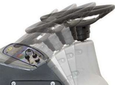
Clear-View™ design and adjustable tilt steering column enable an ergonomic ride for most operators.