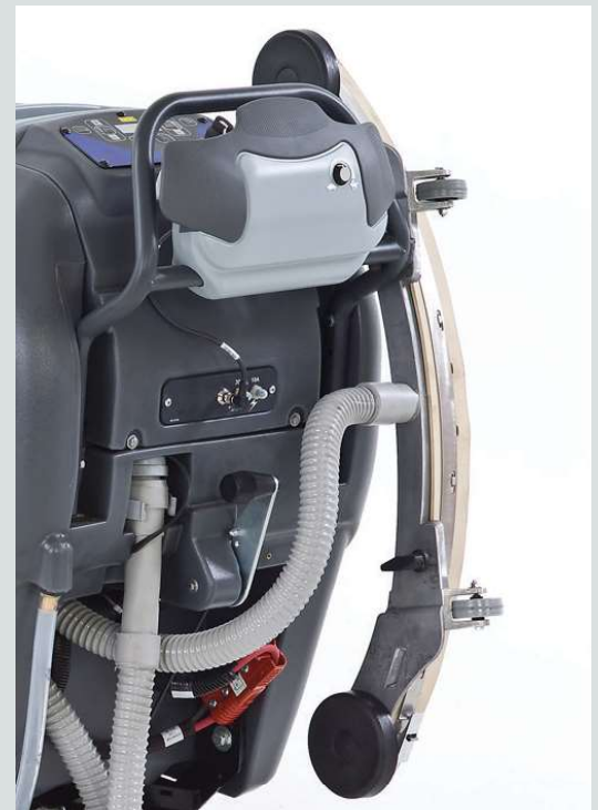
A built-in squeegee hanger makes transport easier and reduces trip and fall accidents.

One-Touch™, integrated scrub pressure and solution flow rate settings: