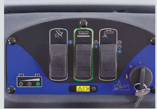
The SC750 ST / SC800 ST – provides simple operation and robust scrubbing controls.