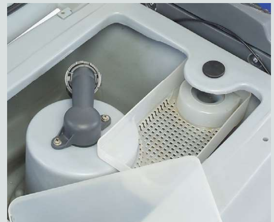
An integrated debris catch cage traps and collects drain clogging debris.

For use on extreme soil levels (10% of scrubbing applications)