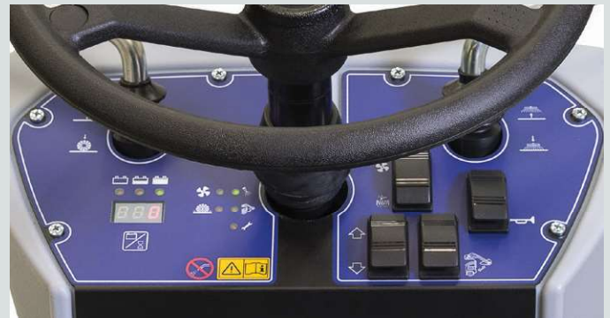
The SW4000™ offers One-Touch™ sweeping with a single switch. Integration with the drive pedal ensures and minimizes broom wear and maximizes run-time.

To ensure the filter remains dust-free for optimal performance, the SW4000 features a timed Liberator™ multi-frequency filter shaker that cleans the filter more effectively to restore airflow for maximum dust control.