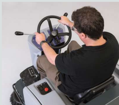
Clear-View™ enhances operator safety.