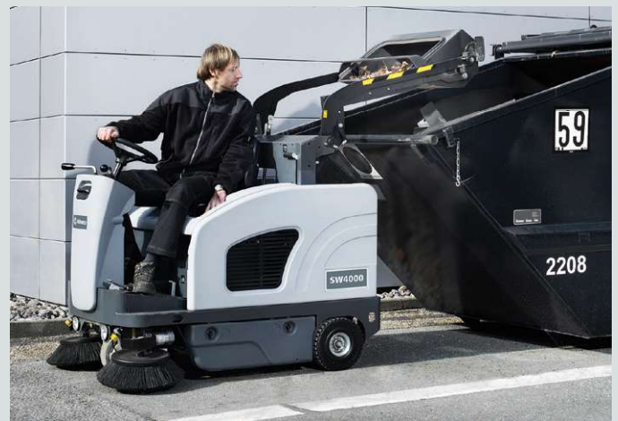
High hydraulic dump enables fast dumping. The retractable hopper minimizes machine length to provide best-in-class maneuverability.