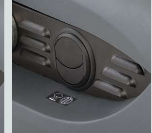
Wet sweep bypass protects the filter from water fouling when sweeping in wet conditions.