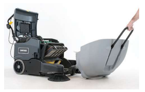
Single hand hopper removal and installation with wheels to facilitate easy transport for dumping.