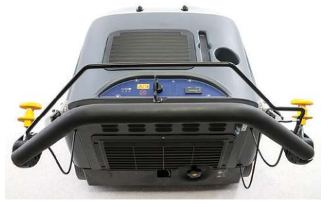
All brooms are adjustable from the operator's position.