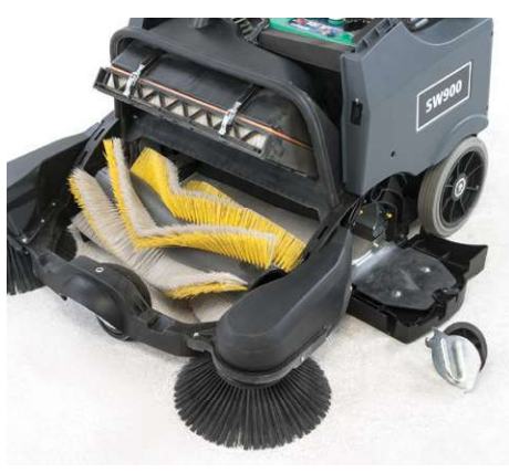
Time-saving maintenance: Broom replacement, and other routine maintenance, can be performed without tools.