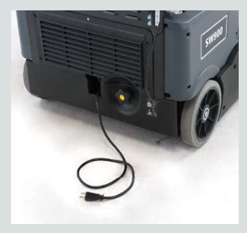
An onboard charger provides the convenience of charging anywhere a power outlet is available.