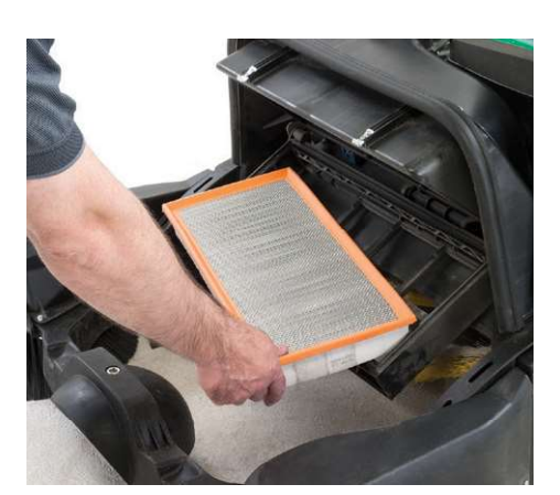
Single-stage high capacity dust control system for more effective dust control. Access filter without tools.