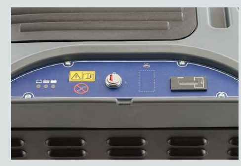
Control panel with key switch, battery charge indicator and hour meter.