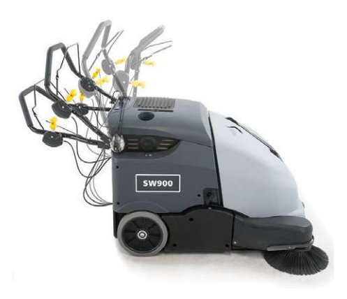
Handlebar adjusts to fit a wide range of users and folds to provide convenient transport and storage.