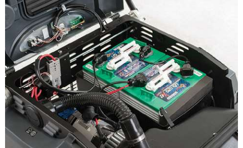
Hood opens providing full maintenance and service accessibility to the battery compartment.