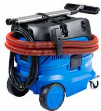
Combined hose and cable hook for easy and quick storage and flexible strap for fixation of power cord, hose and accessories and tools.